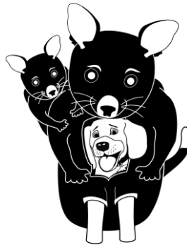
Possum Mint- Lemon-Ginger