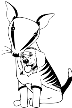
Numbat Strawberry - Basil