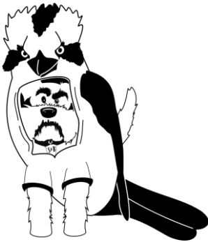
Kookaburra Rhubarb - Lemon

Please ask which are currently available