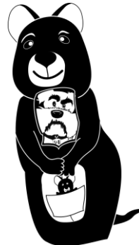
Quokka Apricot- Rosemary

All ingredients (apart from lemons) from Austria!