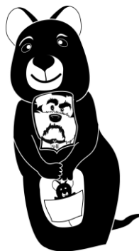
Quokka Apricot- Rosemary

All ingredients (apart from lemons) from Austria!