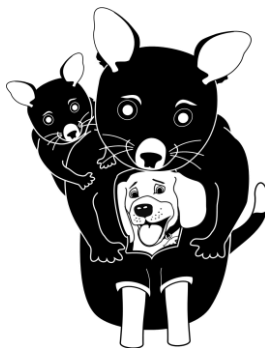
Possum Mint- Lemon-Ginger