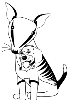
Numbat Strawberry - Basil