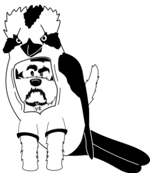
Kookaburra Rhubarb - Lemon